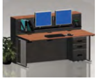
iTrac can be configured with a wall cube that accepts slatwall, rack-mount modules or blank panels for field customization

Configuration with display walls and flat monitor mounts