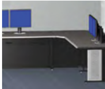
iTrac can also be configured as a desktop console with extra-deep worksurfaces